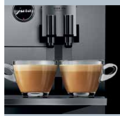
Variable dual spout with 2 coffee spouts and 2 milk spouts